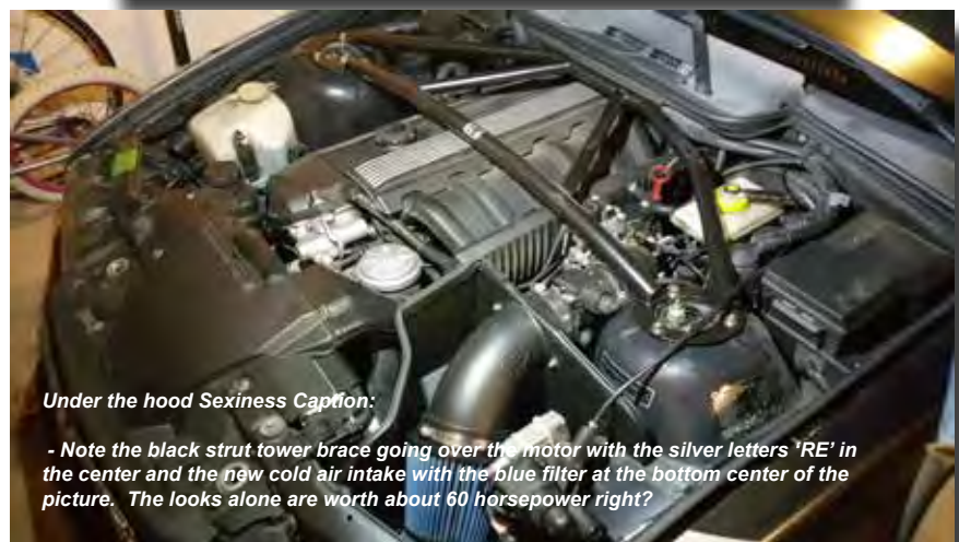
Under the hood Sexiness Caption:

- Note the black strut tower brace going over the motor with the silver letters 'RE' in the center and the new cold air intake with the blue filter at the bottom center of the picture. The looks alone are worth about 60 horsepower right?