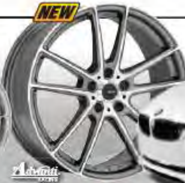
Advanti Racing Drago 18 19