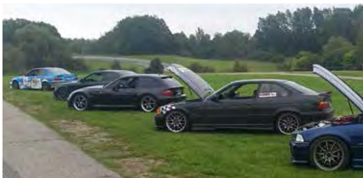
Grattan is one of the most picturesque tracks I have been to, the first time I pulled in I thought I was at a golf course!

I'll see you at the track in 2016 – NeverLift!