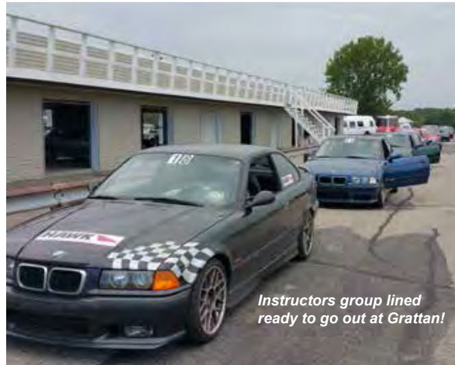
Instructors group lined ready to go out at Grattan!